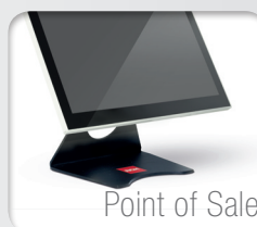
Point of Sale