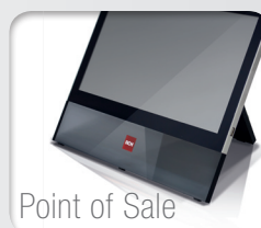
Point of Sale