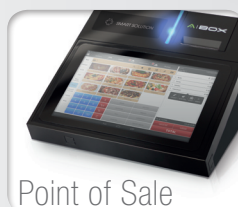
Point of Sale